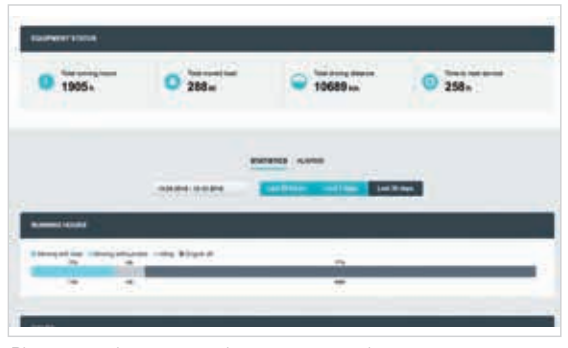
Plan your maintenance and spare parts needs.