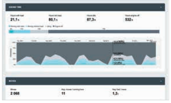
View each machine's movements as they occur.