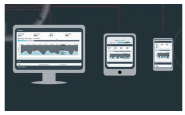
Access on mobile, tablet or traditional screen.

Kalmar Insight* comes fitted in all new Kalmar machines and can be retrofitted to existing Kalmar machines or those built by other manufacturers.